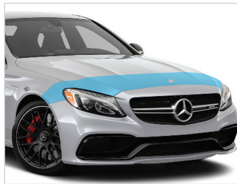
Partial Hood and Fender

Clear gloss polyurethane for stone chip protection, high wear, and abrasion in the automotive, motorcycle, RV, powersports, bicycle, aircraft, and other transportation markets.