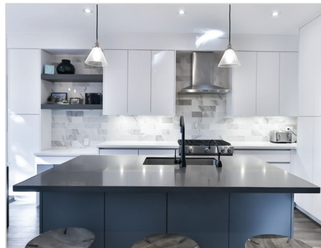
Appliance and Countertops

RX10 gloss thermoplastic polyurethane film designed to protect commercial monitors, personal devices, and other surfaces.