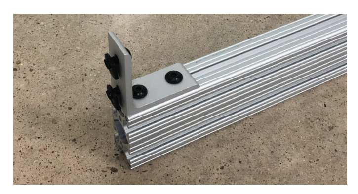
5. Fasten "L" brackets to the end of the 10' double rail.