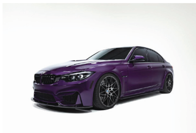
PAINT PROTECTION FILM

XPEL FUSION PLUS Ceramic Coating adds depth, improves shine and surface clarity while protecting your vehicle from the elements with its super hydrophobic formula. All designed to withstand years of driving.