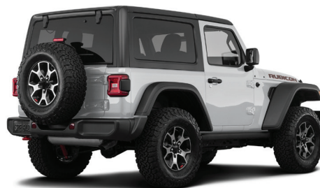
Plastic & Trim

XPEL FUSION PLUS PLASTIC & TRIM Ceramic Coating adds ease of mind with protecting your vehicles plastics and trim. All designed to withstand years of protection.