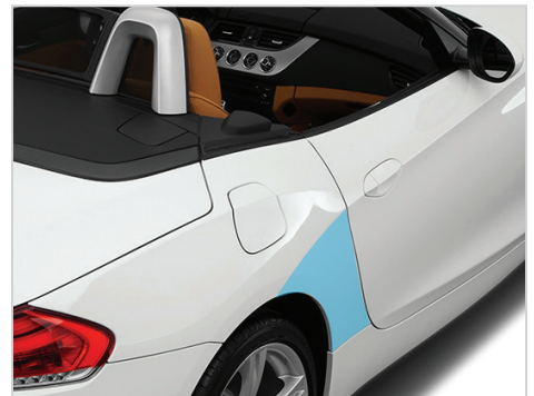
Rear Quarter Panels